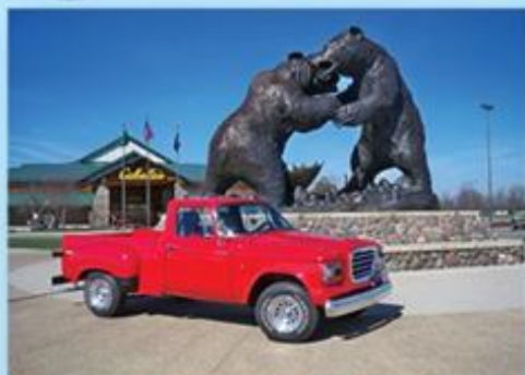
Hosted by the Western Lake Erie Chapter