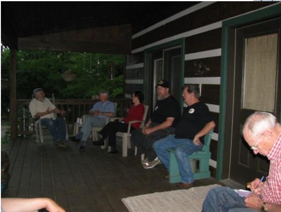
Just hangin on the front porch