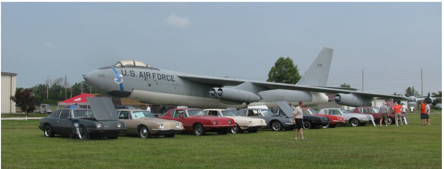
The Avanti Club