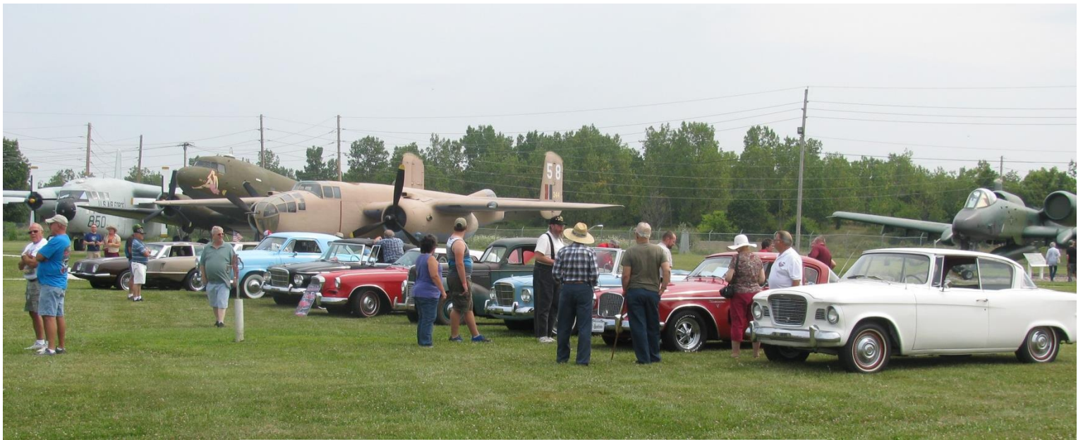
Visitors and club members enjoyed looking at the cars and planes

A B-58 like the one Lt. Col. Sid Kubesch flew on a world setting speed record from Toyko to Paris on October 16, 1963 of 8:35:20. The record still stands.