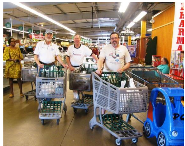
A successful day.