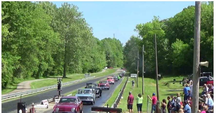
Coming down the track