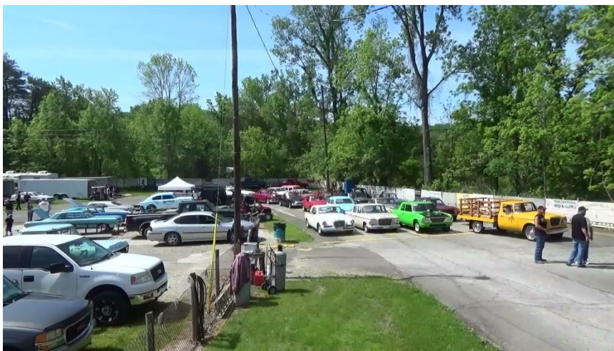
Staged and ready to make parade lap

The cars stretched for over an eighth of a mile starting at the burnout box about three car lengths before the start line, and ending about four car lengths past the finish line! While we were all lined up in front of the spectators, we stopped for pictures. The Brown County Democrat had a local reporter on hand that interviewed several people during the event for the newspaper.