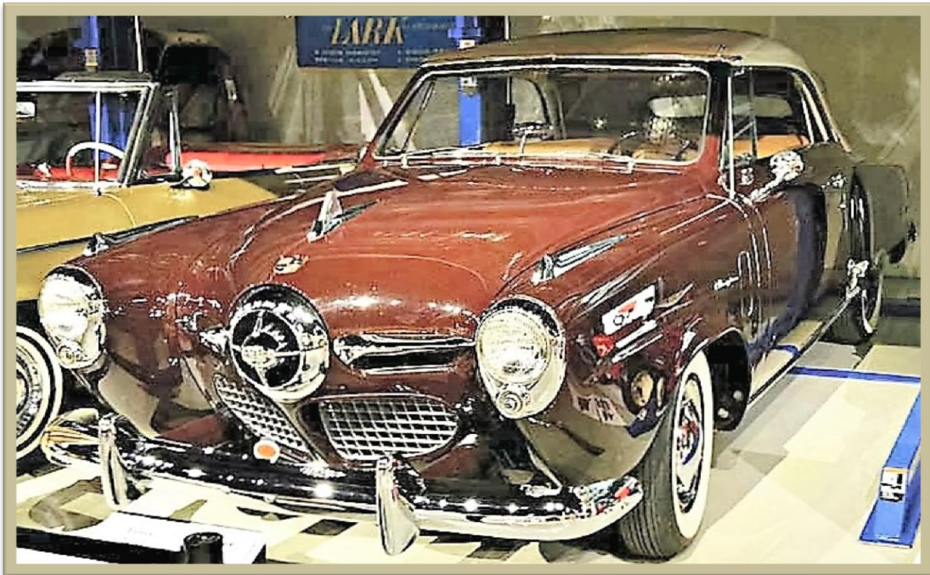
1950 Champion Convertible adopted by the club at the Studebaker National Museum