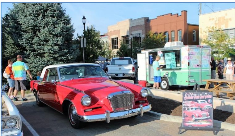
Larry Hopkins 1962 Gran Turismo