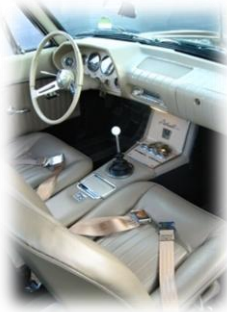
Inside the Avanti