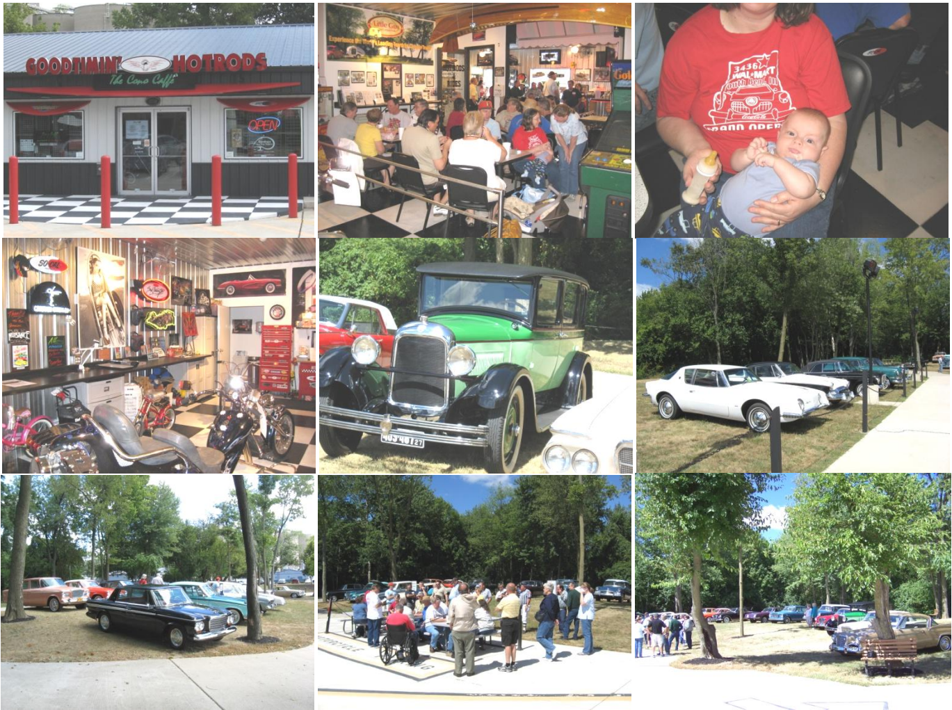
September Meeting