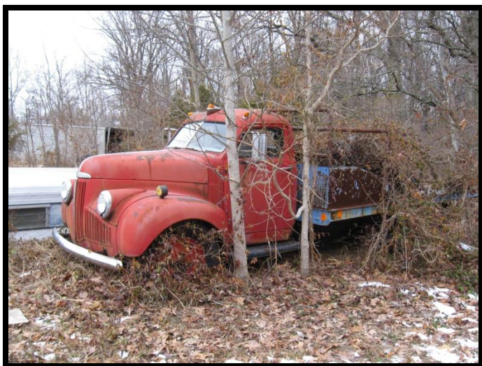
1947 M SERIES FIRE TRUCK