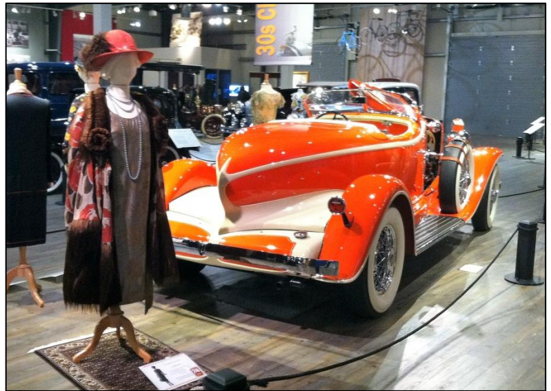
1933 Auburn, Model 12-161A Custom Boattail Speedster