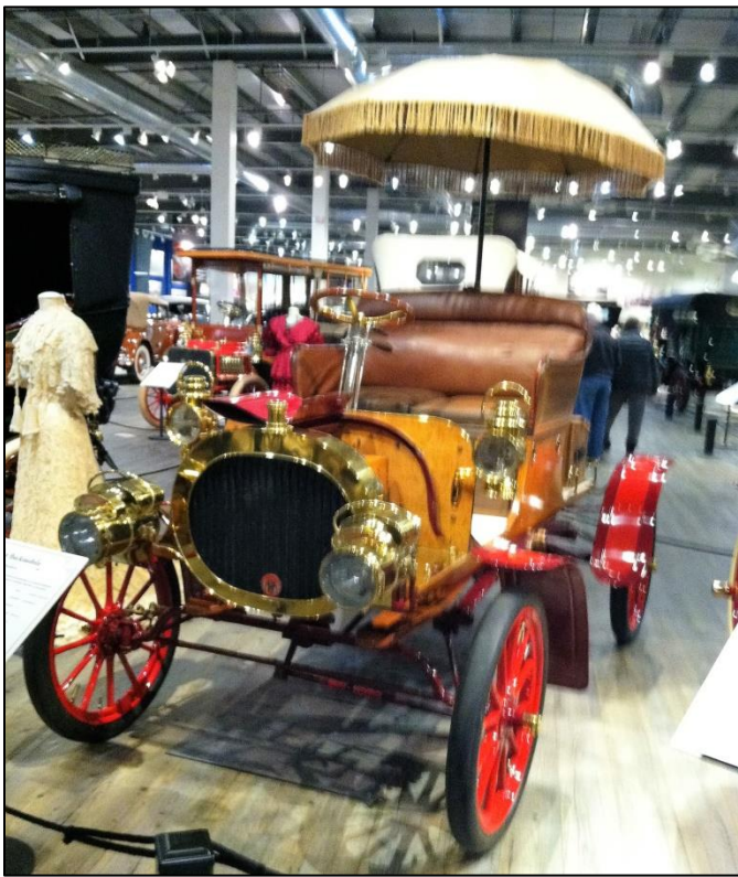
1904 Buckmobile Runabout