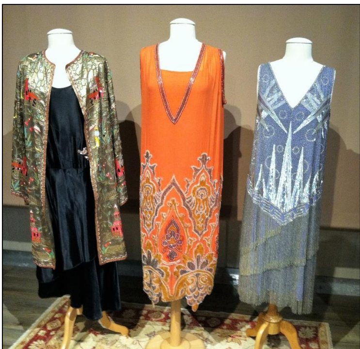
And for the ladies, three beautiful dresses and instructions to Building a Silhouette. OUCH!