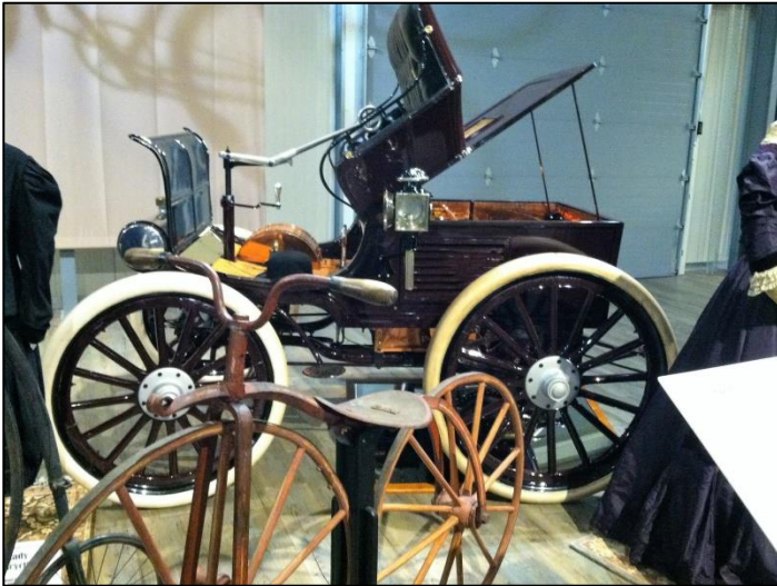
1899 Hertel Runabout