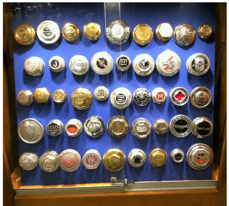
Can you spot the Studebaker center cap?