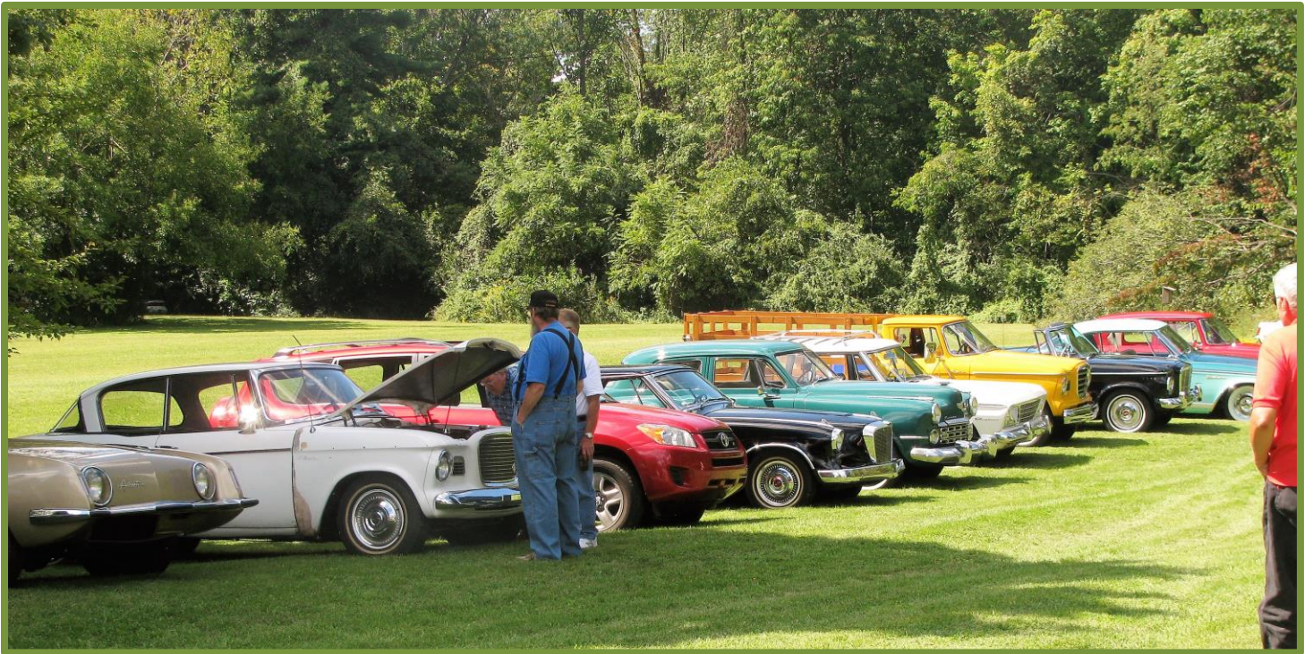
A great picture from the Summer, 2014