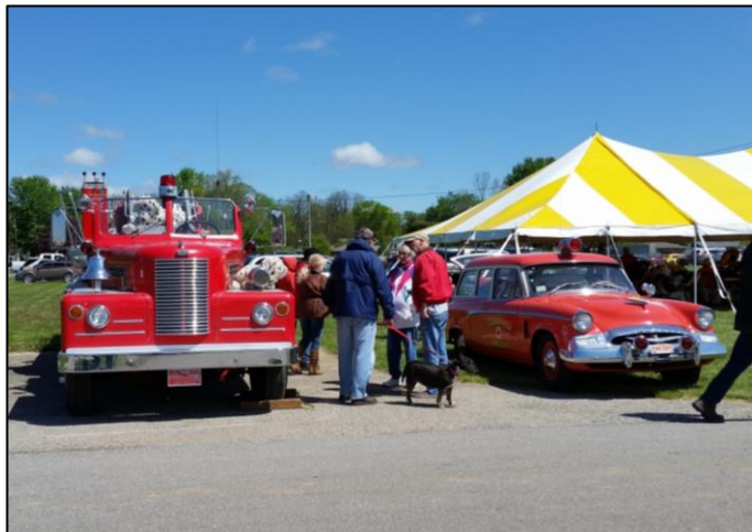
Studebaker firetruck and ambulance