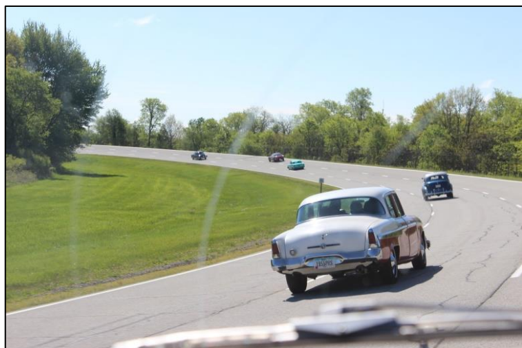
At the Proving Grounds