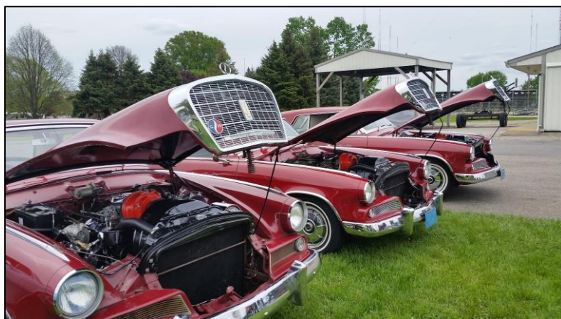
Three 1964 Rs GT's