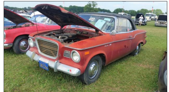
1960 Lark Convertible $13,000