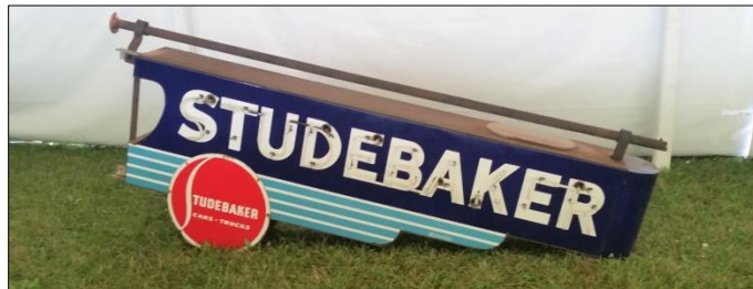
Broken neon sign $9,000

which had 300 more vehicles to be auctioned, a lot of the big trucks, wagons, buggies and some of the rustier cars but almost all of them sold for "good" money. I look forward to seeing some of these unusual projects surface at shows in the future.