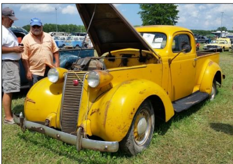
1937 Coupe Express $31,000