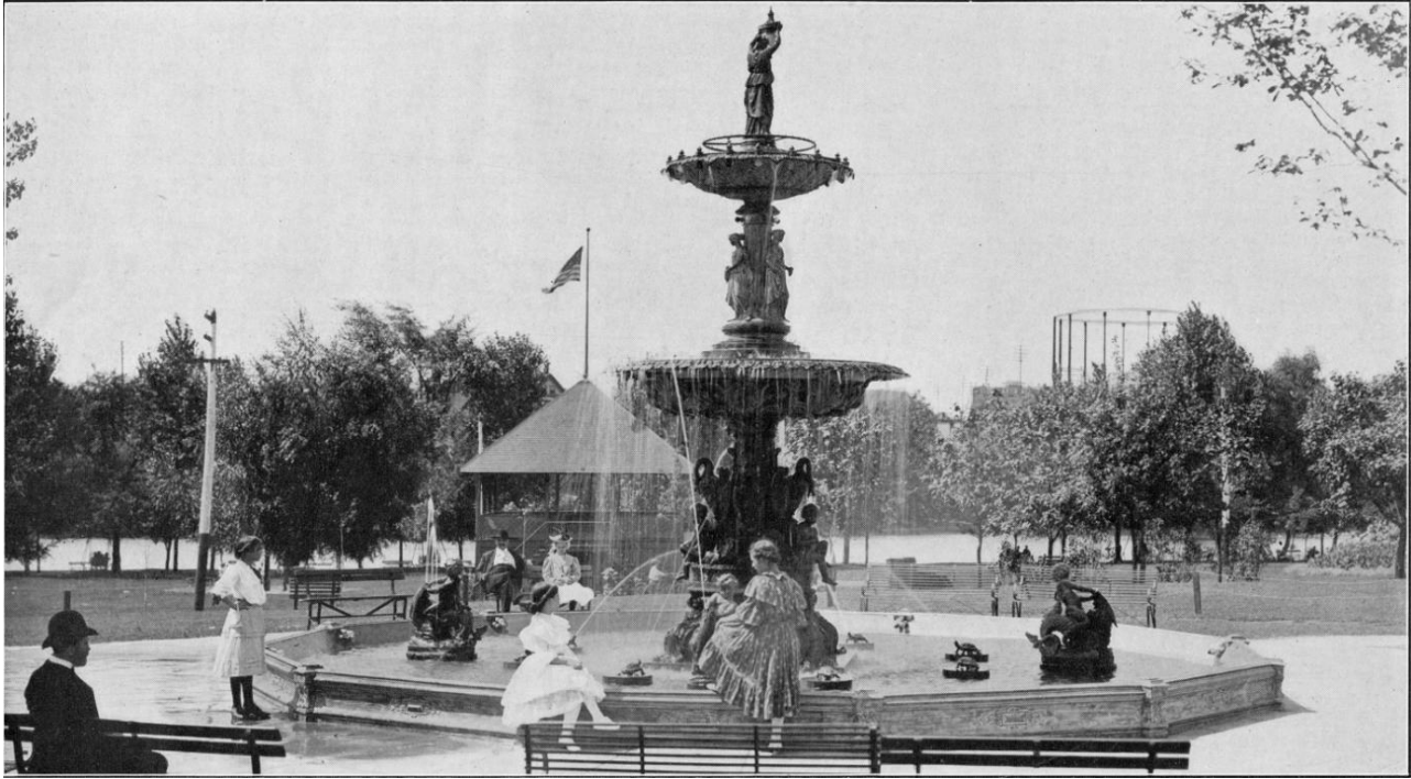
Studebaker Electric Fountain, South Bend.

POSTED ON JANUARY 23, 2018 BY INDIANA LANDMARKS | INDIANA AUTOMOTIVE LANDMARKS, NEWS