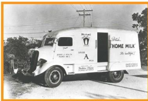
1936 Studebaker 2M282 Miami Milk Truck

And...the best part about these culinary memories is a "tip of the hat" to Studebaker's history. It's a pretty safe bet, that if your family lived in Indiana, your family's milk and butter (used in many of the recipes) were delivered in a Studebaker!