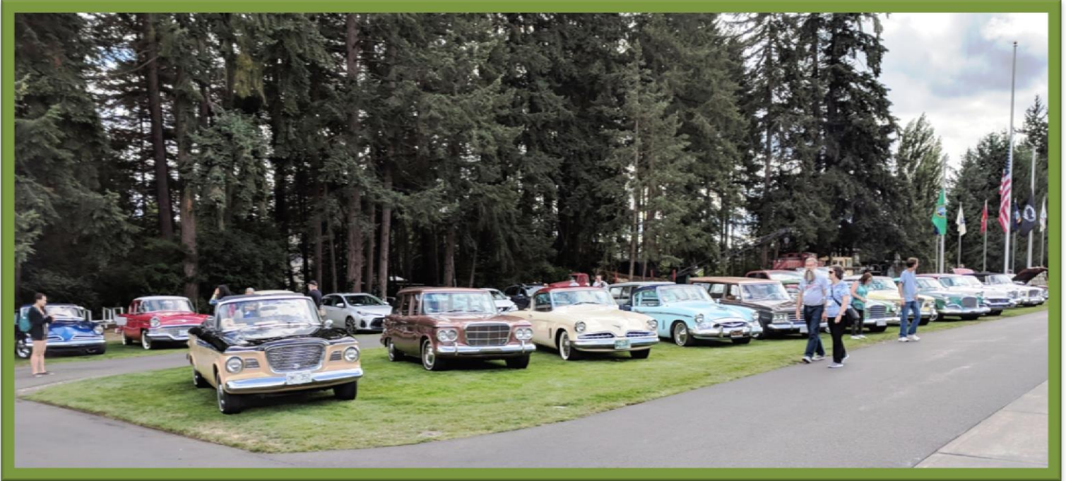
Photo from Studebaker International in Seattle, Washington