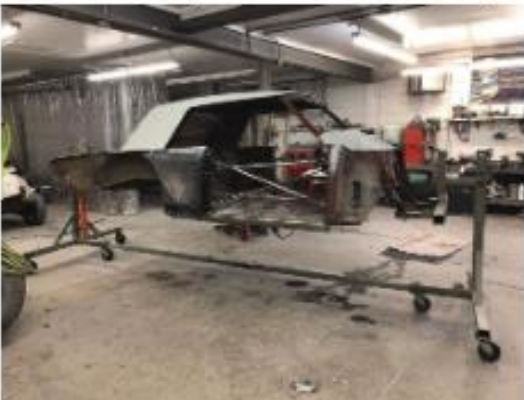
Floating in air/ the body off the frame