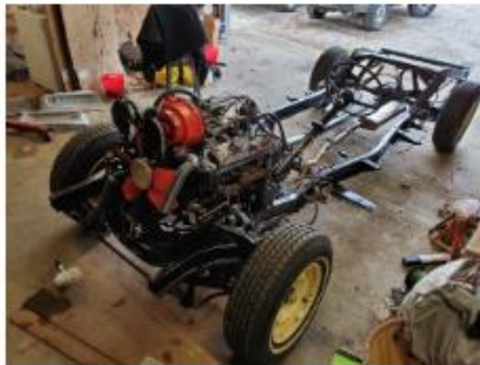
The frame ready for the body