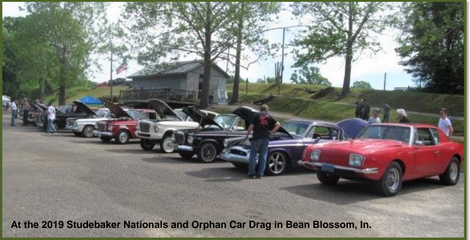
At the 2019 Studebaker Nationals and Orphan Car Drag in Bean Blossom, In.