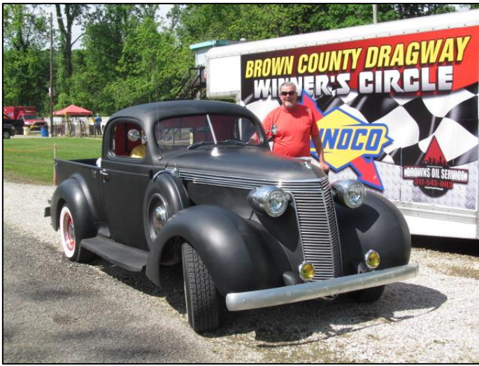
Dan and Shiela Bauer of Trafalger, IN with their 1937 Coupe Express