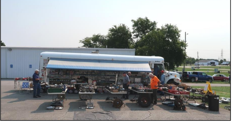
One of the many vendors at the meet.