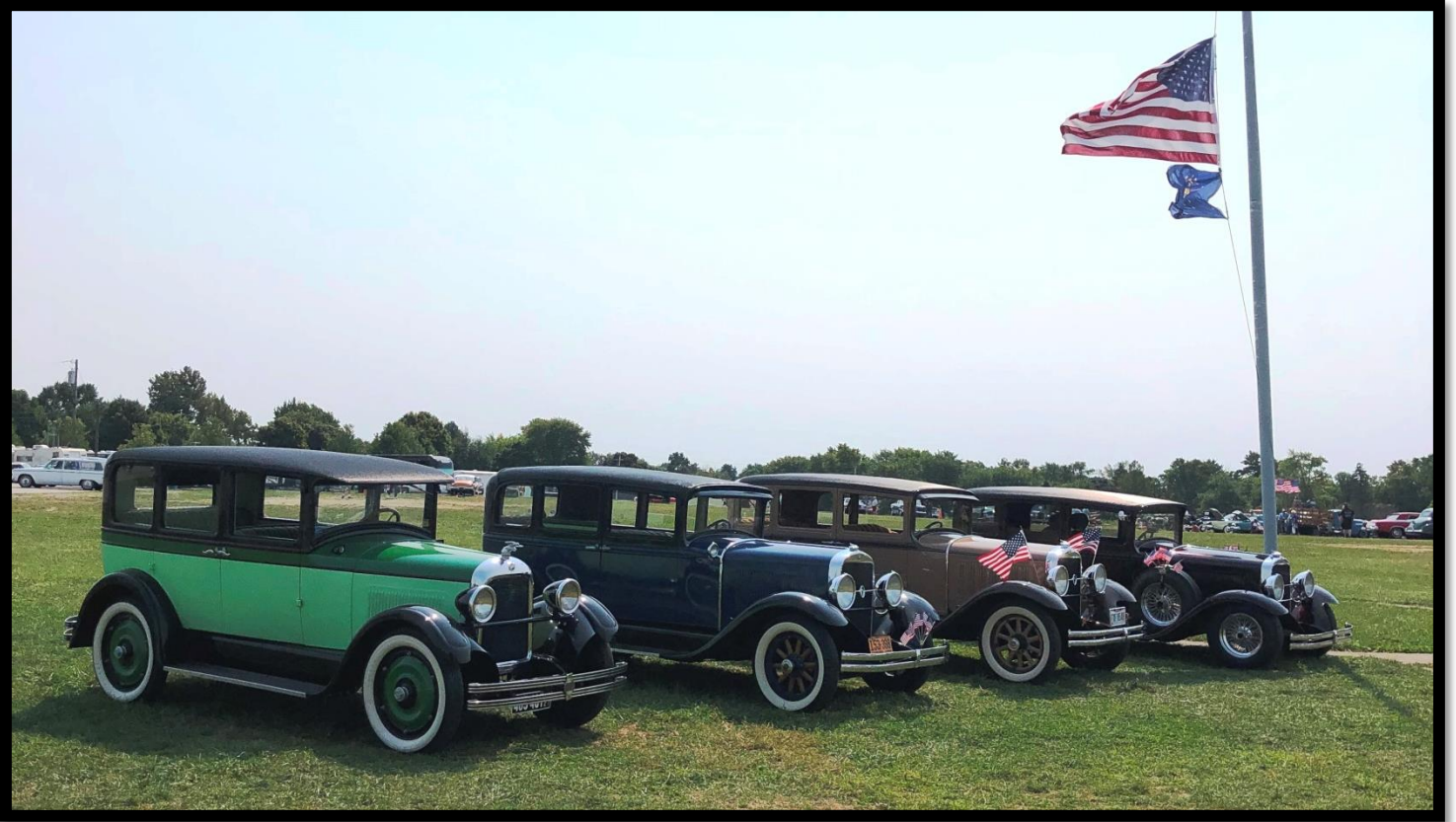
1927, 1928, 1929 and 1930 Studebaker Dictators. This photo or one similar and an article is scheduled to be in The Antique Studebaker Review magazine in the near future.