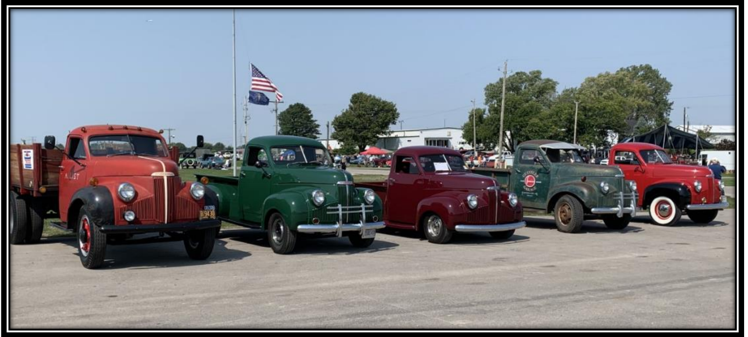
Another photo from Studebaker International, Indianapolis, 2021