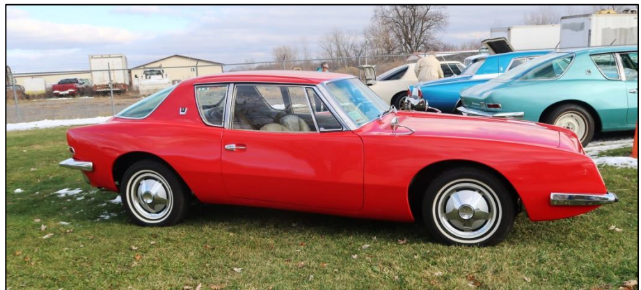
Happy 50 th Birthday to Dave Arlands 1963 R1 Avanti Serial No. 1662 which was built November 5, 1962.