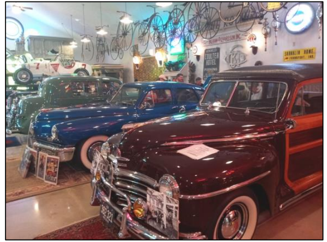
Inside the Goodwin Funeral Home Museum