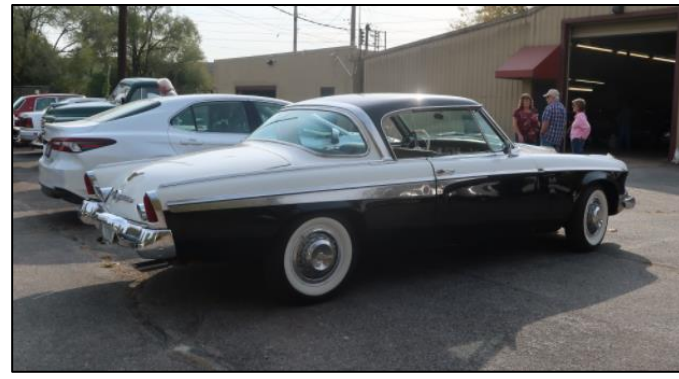
Another SDC members Studebaker